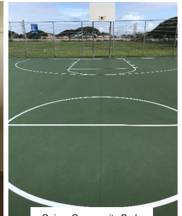
Geiger Community Park