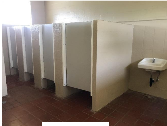
Petrie Community Park