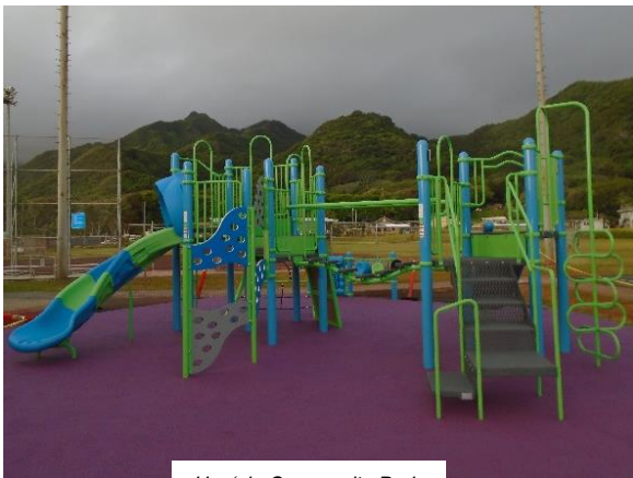
Hau'ula Community Park